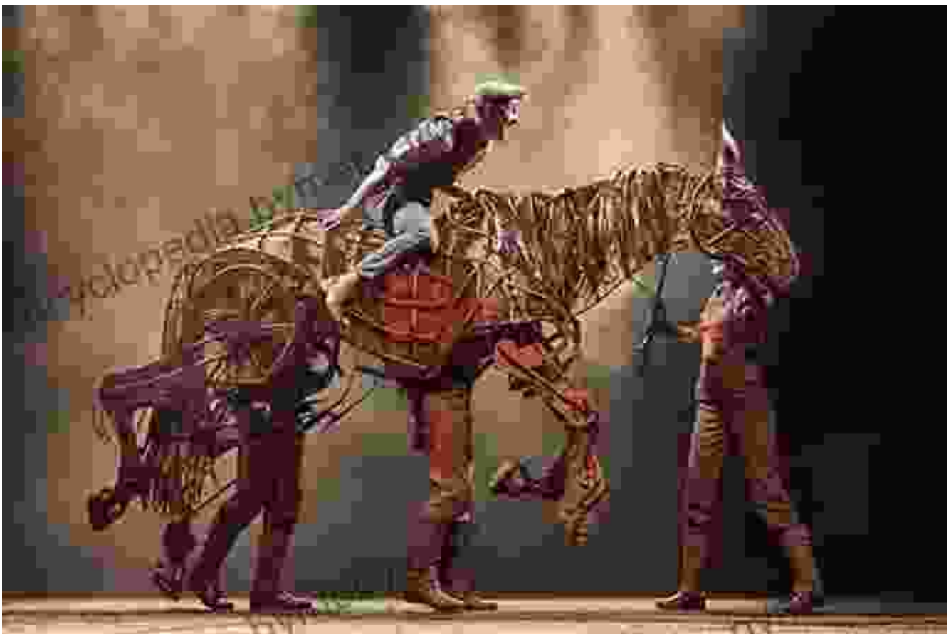
War Horse on stage at the National Theatre, London

The National Theatre provided the resources and artistic expertise necessary to realize Handspring's ambitious vision. Meanwhile, Handspring brought its unparalleled skill in puppetry and storytelling to the production. Together, they created a unique and immersive theatrical experience that would captivate audiences for years to come.