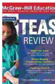
Image alt text: McGraw Hill Education TEAS Review, Third Edition book cover