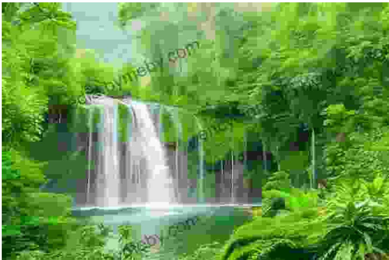
Dunn's River Falls, a breathtaking natural water slide

The Cockpit Country, a rugged wilderness in the island's interior, is home to a unique ecosystem and a rich biodiversity. For a refreshing dip, head to Dunn's River Falls, a series of cascading waterfalls that create a natural water slide.