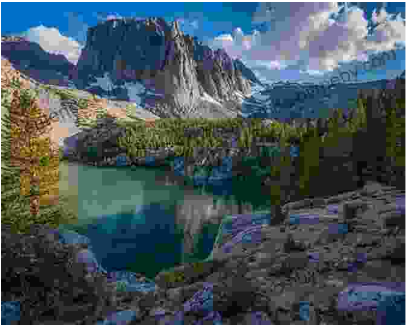
John Muir in the wilderness