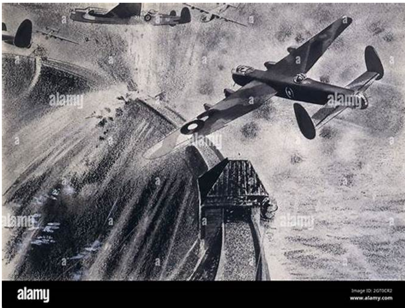
Lancaster bombers approaching the Möhne Dam on the night of the raid.

missions can be accomplished through meticulous planning, technological innovation, and unwavering courage.