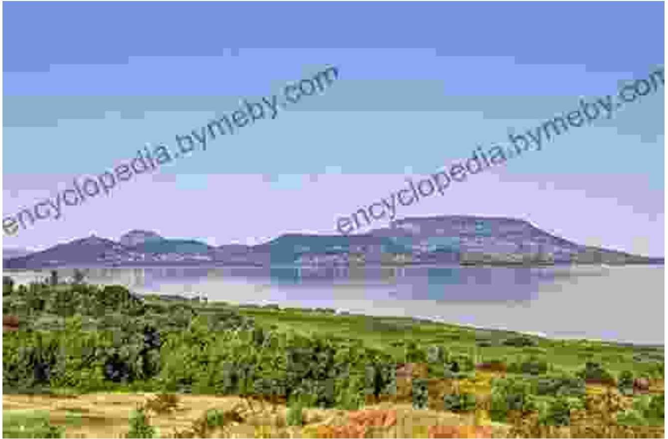
Escape to the shores of Lake Balaton, a haven of tranquility and natural beauty.